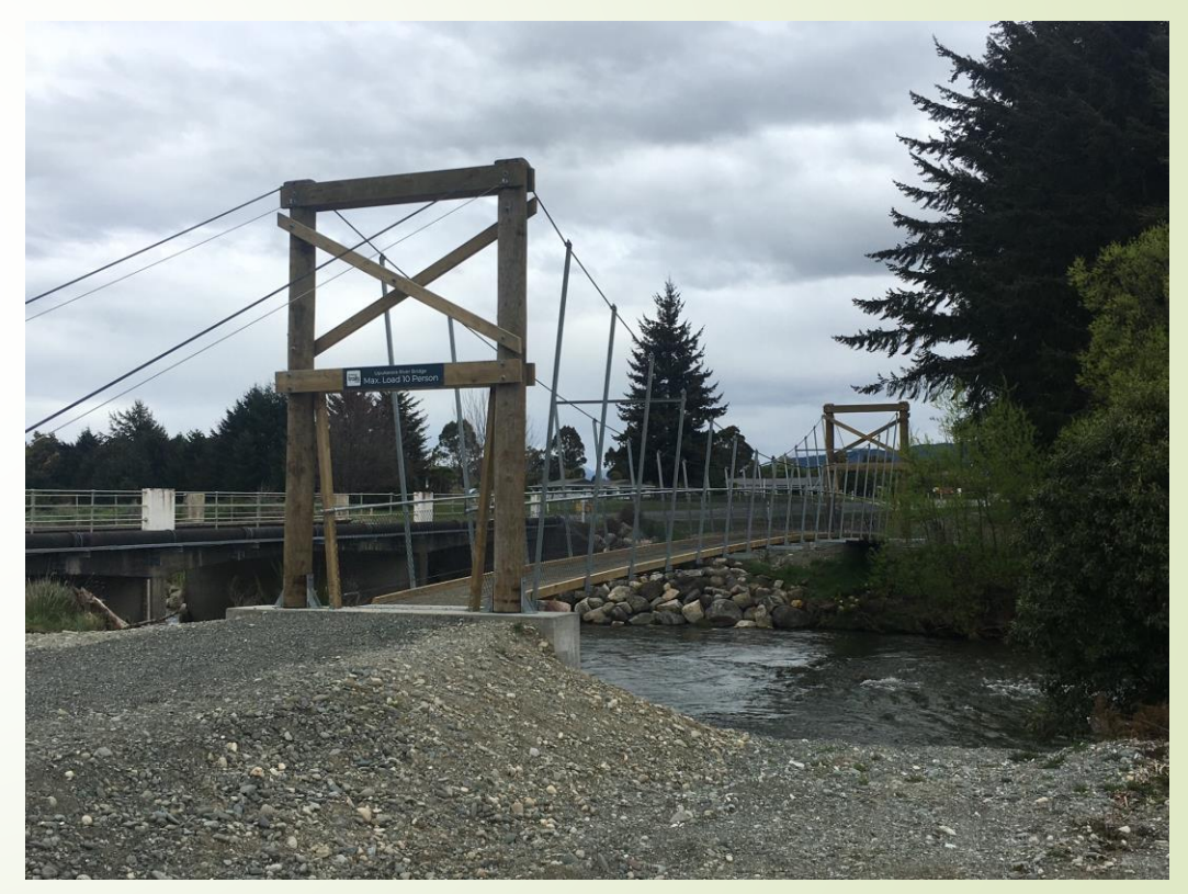
The Upukerora Bridge crossing, fully funded and maintained by the NZ Transport Authority. Cost $250k

2km of trail from the lake edge to the Upukerora Bridge Has been completed and is in use. Part funded by JFN, FCB and local funding, total cost $80k