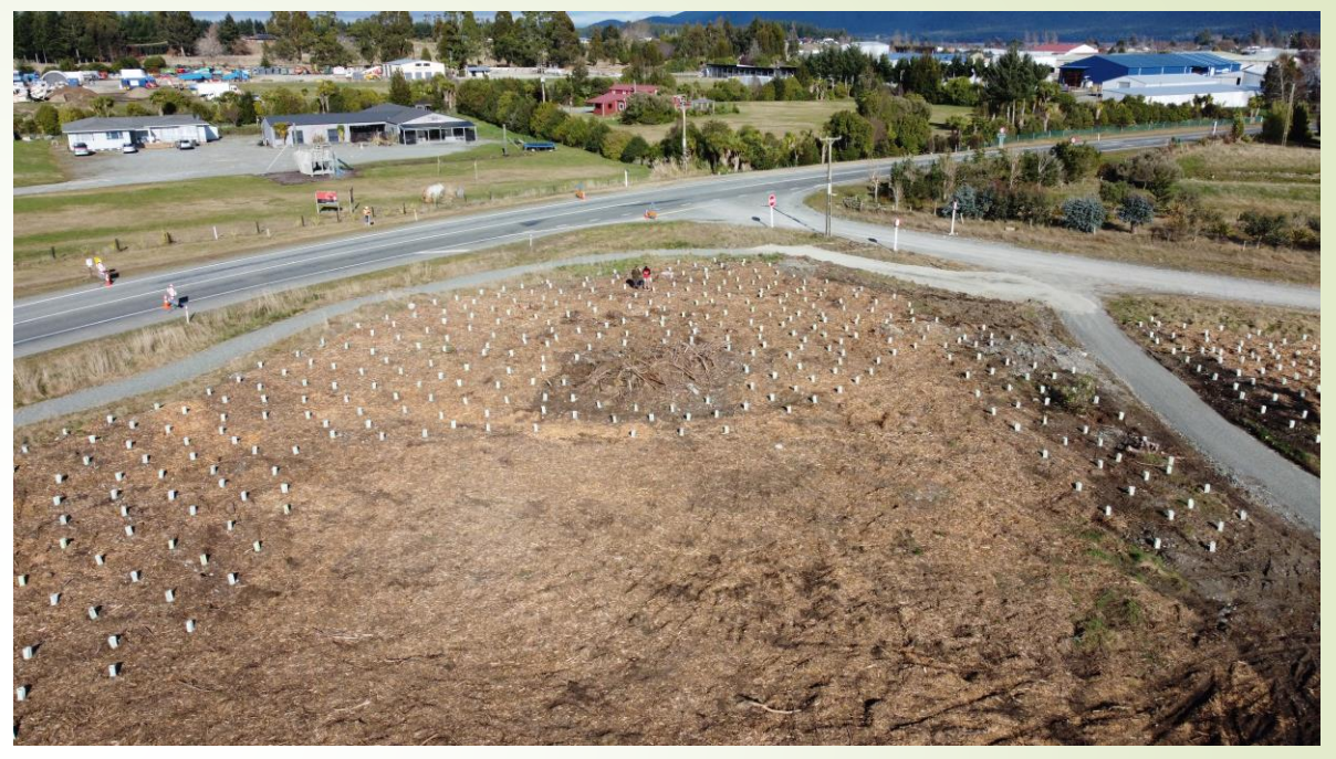
True left – pine plantation removed, 3200 native plants planted